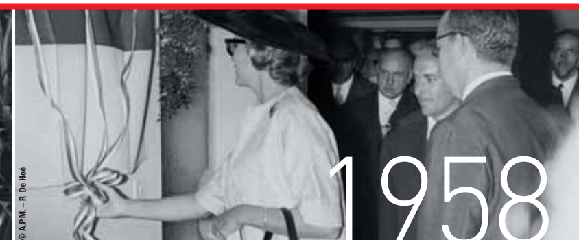
25 September 6: Visit to new buildings housing the Princesse Grace Hospital Centre and inauguration of the Telecobaltherapy Unit run by the Monaco Red Cross.