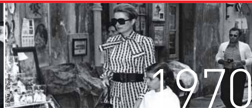
08 HSH Princess Grace takes HSH Princess Stéphanie to school, rue Comte Félix Gastaldi.