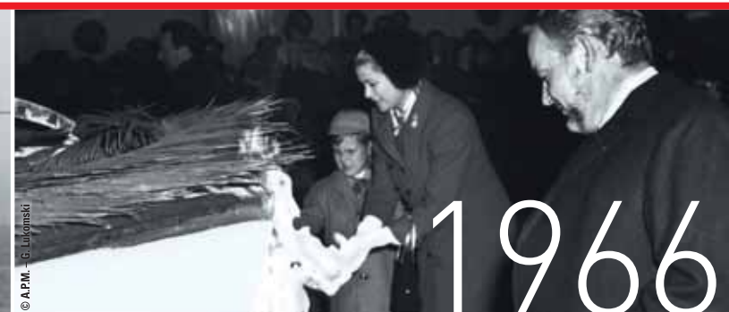
13 January 27: Feast of St Dévote, patron saint of Monaco: traditional burning of the boat decorated in the colours of Monaco.