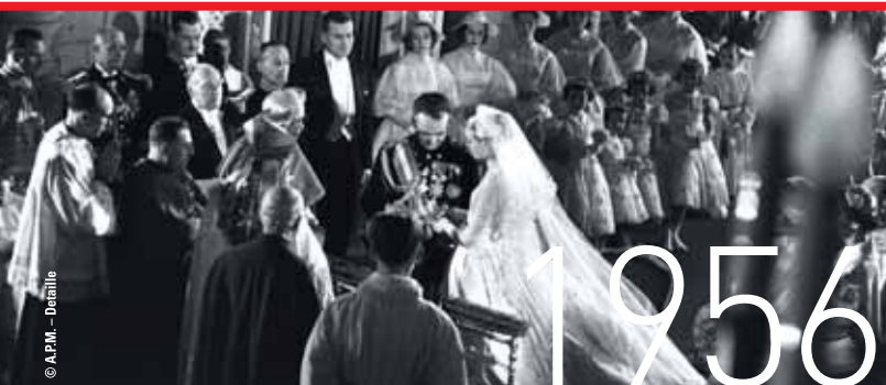
06 April 19: Official church wedding between Their Serene Highnesses Prince Rainier III and Princess Grace at Monaco Cathedral.