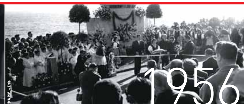
19 December 2: Inauguration of Avenue Princesse Grace, which runs along the length of the Larvotto district from Portier to the Monte-Carlo Beach.