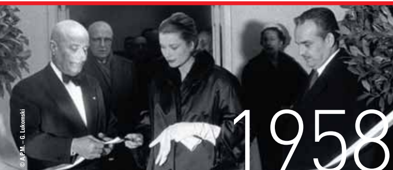
11 January 22: Inauguration of the new building for Public Safety. HSH Princess Grace, the organisation's figurehead, cuts the symbolic ribbon.