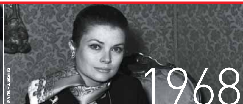
22 December 20: Recording of an appeal broadcast in aid of the World Association of Children's Friends (Association Mondiale des Amis de l'Enfance – AMADE) at the Prince's Palace. Founded in 1963 by HSH Princess Grace, AMADE aims to help and support underprivileged children and improve living conditions for children all over the world.