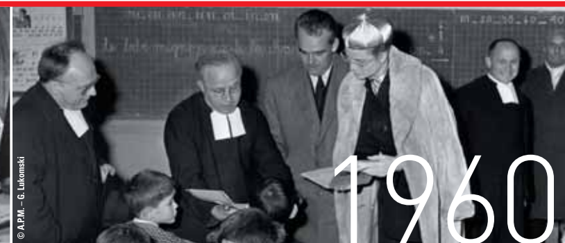
09 January 12: Their Serene Highnesses Prince Rainier III and Princess Grace visit a primary school for boys in Monaco-Ville.