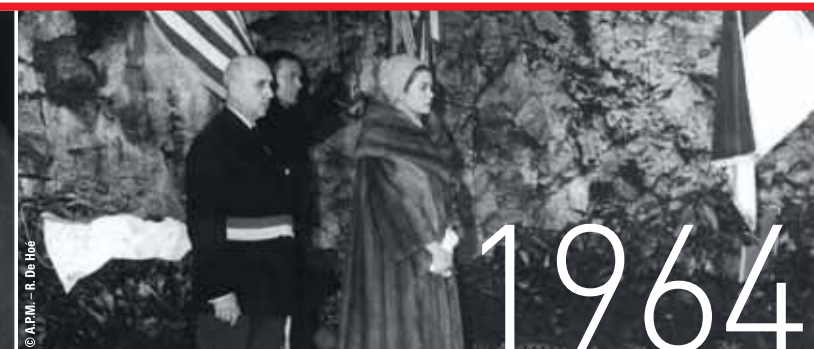
14 March 15: Inauguration of Avenue John F. Kennedy, in memory of the late US President.