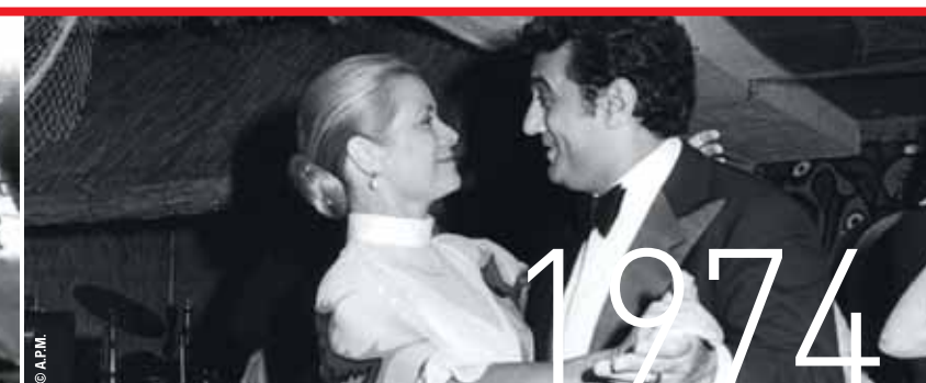
20 June 28: Inauguration of the new Maona and Jimmy's de la Mer nightspots at the Monte-Carlo Sporting Club d'Été: HSH Princess Grace dances with Plácido Domingo.