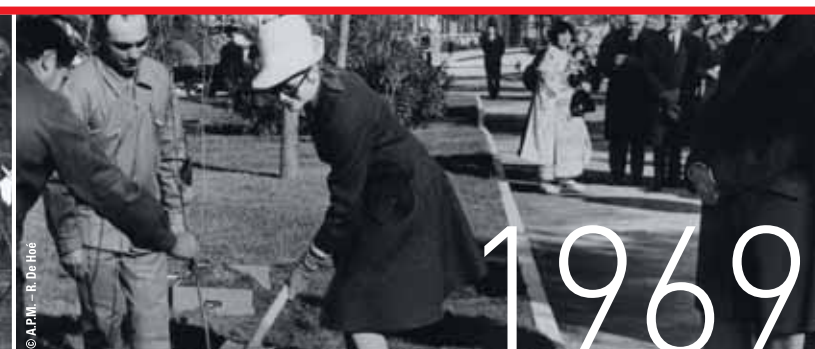
18 November 26: Planting cherry trees – a gift from the Japanese Ministry of Agriculture – in the new Larvotto gardens, developed on land reclaimed from the sea.