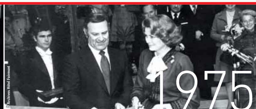
17 November 22: The Loews Monte Carlo Hotel (now the Fairmont Monte Carlo Hotel) opens its doors on the site of the former Monte-Carlo railway station.