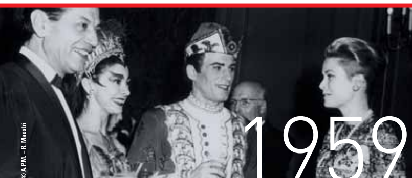
16 December 29: Gala evening in Salle Garnier to celebrate the 50 th anniversary of Les Ballets Russes: HSH Princess Grace and Serge Lifar after a performance of Claude Debussy's "Prelude to the Afternoon of a Faun".