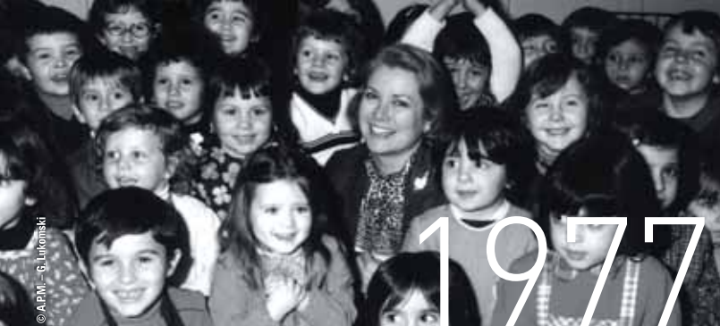
01 September 24: HSH Princess Grace visits children at the Notre Dame de Fatima day nursery, set up at Her behest to care for children between the ages 3 and 6 whose parents work during the day.