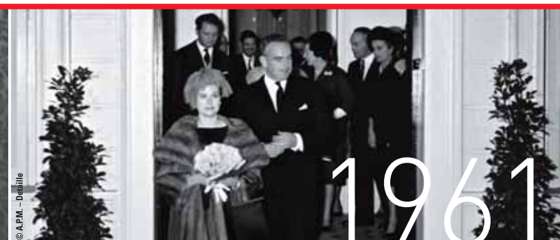
23 November 17: Inauguration of the new Monaco Red Cross headquarters at 27 boulevard de Suisse. HSH Princess Grace became president of the association in 1958.