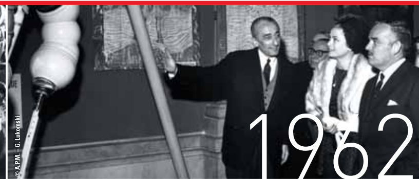
07 April 14: Inauguration of the Homme sous la mer (Man below the sea) exhibition at the Oceanographic Museum. Captain Jacques-Yves Cousteau, Director of the Oceanographic Museum, greets Their Serene Highnesses.