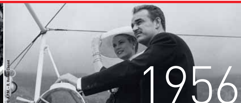
12 April 12: The Sovereign Prince takes His yacht, the Deo Juvante II, out to meet His fiancée, Ms Grace Patricia Kelly.