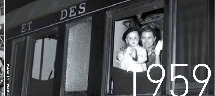
04 October 4: Their Serene Highnesses Princess Grace and Crown Prince Albert leave for Paris.