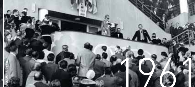
03 November 19: National Holiday: French League Championship football match between Monaco and Reims at the former Louis II Stadium.