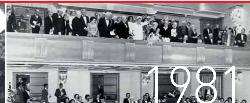
15 December 17: Inauguration of the Princess Grace Theatre: HSH Princess Grace initiated the renovation of the former Salle des Beaux Arts, unused since 1956, which was reopened as the Princess Grace Theatre.