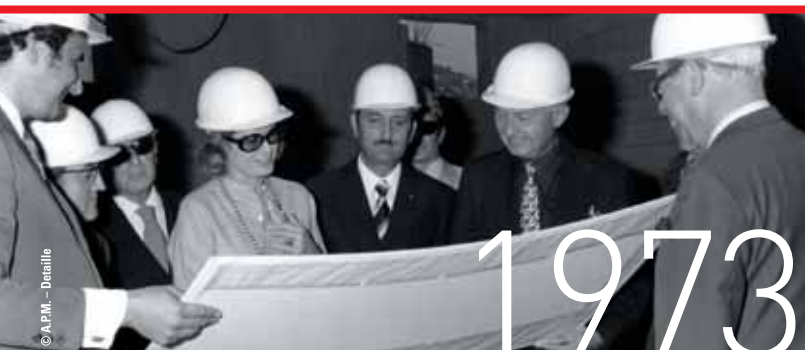
21 September 27: Visit to the site of the future Monte-Carlo Sporting Club d'Été, opened in 1974.