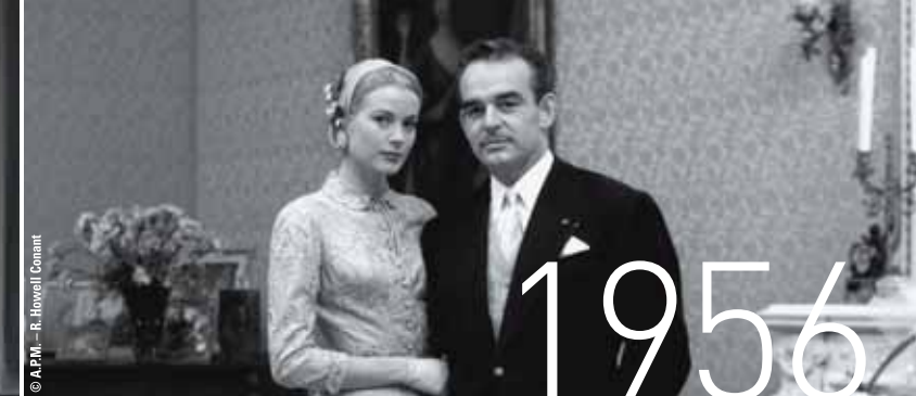
05 April 18: Civil marriage ceremony between Their Serene Highnesses Prince Rainier III and Princess Grace of Monaco.