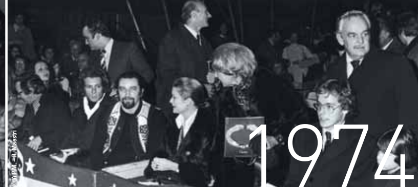
02 December 26-30: 1 st Monte-Carlo International Circus Festival: prizes awarded by Their Serene Highnesses Prince Rainier III, Princess Grace and Princess Stéphanie.