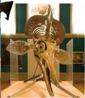
Anna, the ophthalmosaurus skeleton. A big-eyed marine reptile from 150 million years ago.