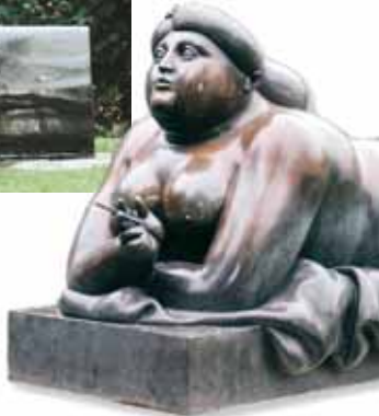
“Woman Smoking a Cigarette” bronze by Botero.