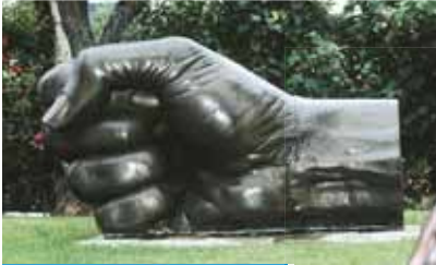
“The Fist” bronze by César.

Like Ariadne’s thread, a “Sculpture Trail” guides us through the works of major contemporary artists from all over the world.