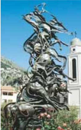
“Cavalleria Eroica” bronze by Arman.