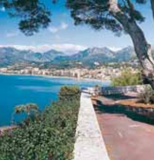
The Bay of Menton.