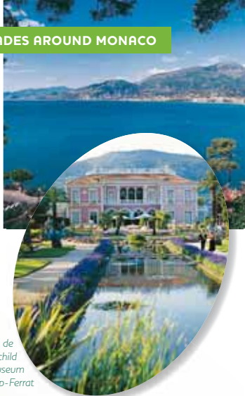
Ephrussi de Rothschild Villa-Museum at Cap-Ferrat

The Principality's location makes it a wonderful starting point for trips brimming with charm, colour, tastes and fragrances in the hinterland, the French Riviera and Italy.