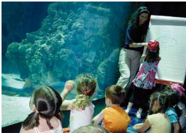
Activities organised by the museum.

On the first floor, an exhibition entitled "The Career of a Sailor" follows the unique trail of the Prince who founded the museum. Following in his wake, we witness the emergence of the major themes of modern oceanography, the field that he pioneered.