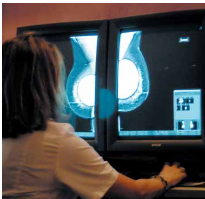
Diagnosis of a mammogram at Monaco's Medical Imaging Centre.

Teaching and research also involve seminars and congresses, which are rapidly developing in the Principality. The reputation of the health and ►