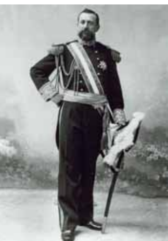
Albert I of Monaco, the "Sailor Prince" 1848-1922.

2009 - Principality elected onto the UNESCO Executive Council. ■