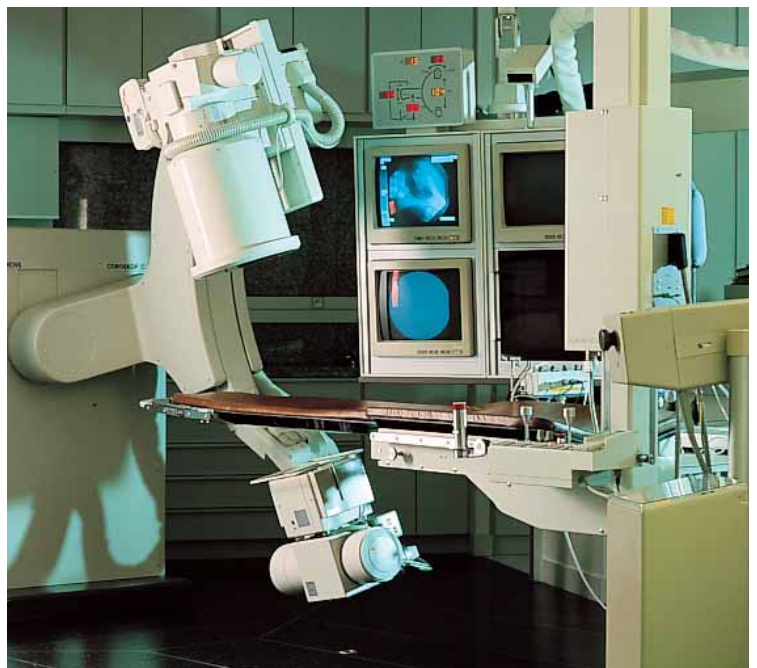
Monaco's Cardiothoracic Centre: the building, a room and the operating theatre.