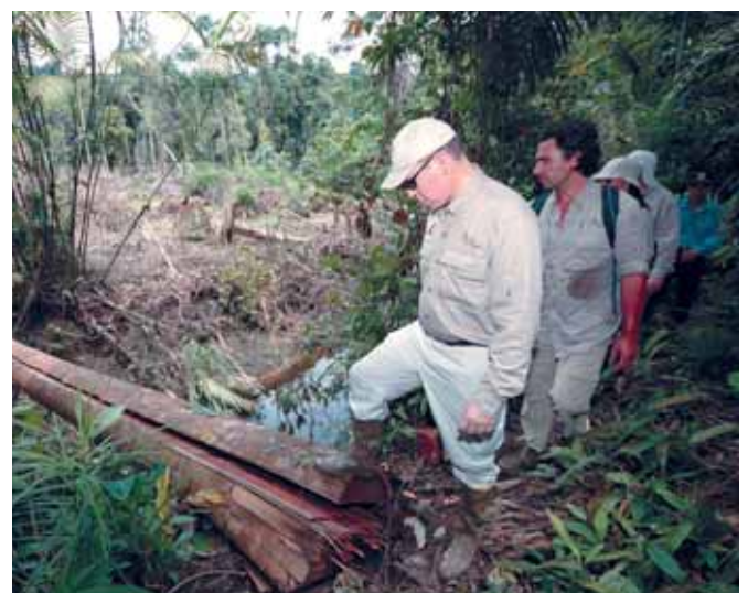
Combating desertification in Mali and H.S.H. Prince Albert II in Siberut, Indonesia, for a project to protect forest ecosystems.