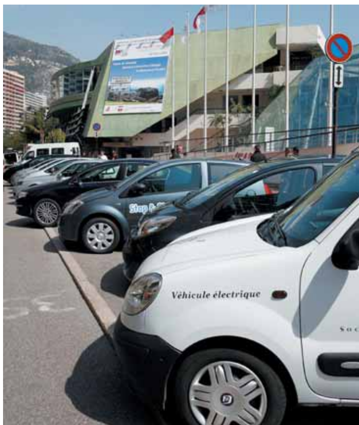
Electric vehicles exhibited at the EVER trade show at the Grimaldi Forum Monaco. Self-service rental of electric bicycles in Monaco's car parks. The MIEV by Mitsubishi, used in several company fleets in the Principality.

In this eco-responsible frame of mind, Monaco encourages the use of public transport, charging competitive fares on Monaco's buses. A policy to develop rail travel was also implemented, with the introduction at the end of 2008 of two new-generation Regional Express Trains . They are part of an order for 5 trains intended to increase services between Nice and Cannes on the one hand, and between Italy and Nice on the other. ►