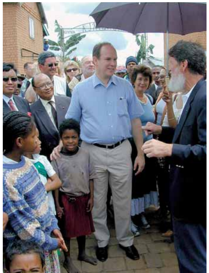
H.S.H. Prince Albert II's visit in 2003 to Father Pedro, founder of the village of Akamasoa in Madagascar, created for the extremely poor and to which the Principality is a major donator.