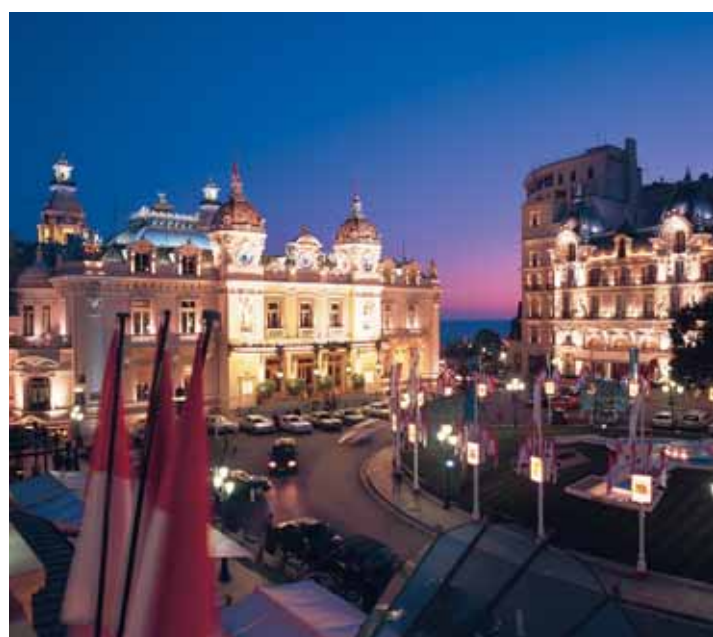
Major economic sectors in the Principality of Monaco: property, tourism and the organisation of congresses.