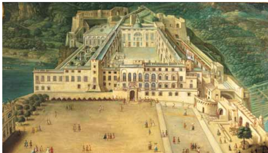
Monaco Palace in 1732. Painting by Dominique-Joseph Bressan. Statue of Rainier I, known as “Malizia” Located on the Place du Palais