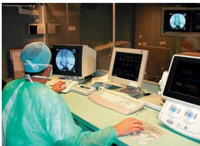
Princess Grace Hospital