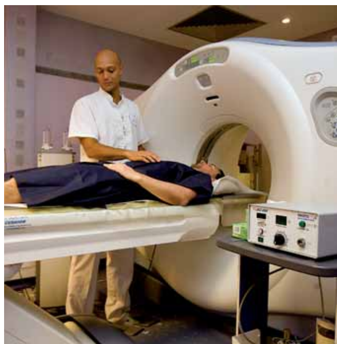
MRI at Monte-Carlo Life Check.