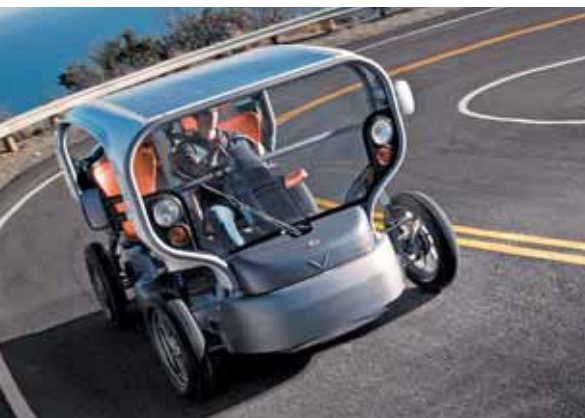
EVER trade show at the Grimaldi Forum Monaco. The Eclectic Concept by Venturi: the first energy-autonomous vehicle. The Astrolab: an electro-solar hybrid vehicle.