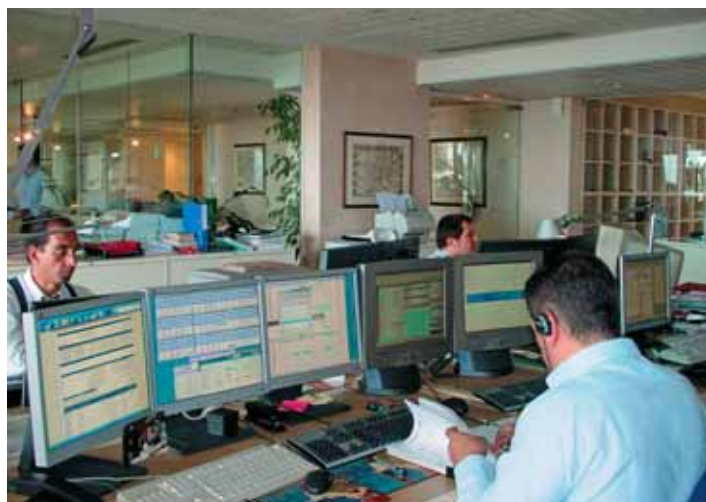
Industry, banking & finance: two major economic sectors in the Principality of Monaco.