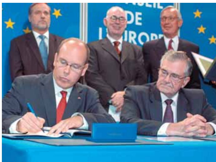
H.S.H. Prince Albert II at the Council of Europe.

As far as communications are concerned, all of Monaco's news is conveyed throughout the ►